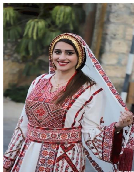
الثوب الفلسطيني المطرز