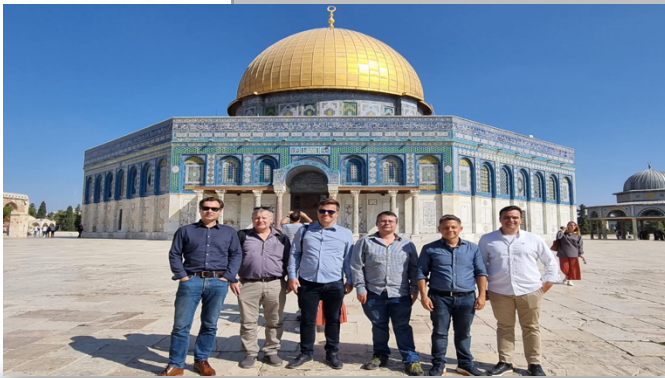
HUNGARIAN JOURNALISTS DELEGATION IN PALESTINE