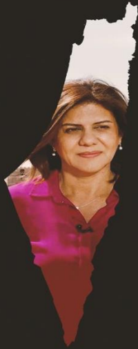
1971 - 2022 SHIREEN ABU AKLEH WORDS DO NOT DIE