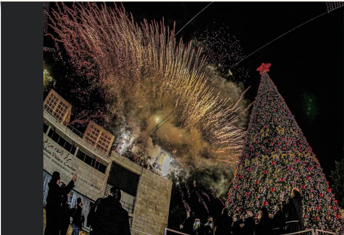
Embassy of Palestine in Hungary

A special occasion in the world, but especially in Bethlehem where Jesus was born. Bethlehem city has celebrated the Christmas tree lighting in the Nativty Square with only a few people in the Nativty square, in order to commit to health protocols. The event, which yearly gathered thousands of people who came to Bethlehem from all areas of the world, was held during the weekend lockdown and in synchronization with the tree lighting in the nearby Beit Jala town. The ceremony included a three-dimensional presentation of the Christmas story and two theater plays, "The Star of Bethlehem."