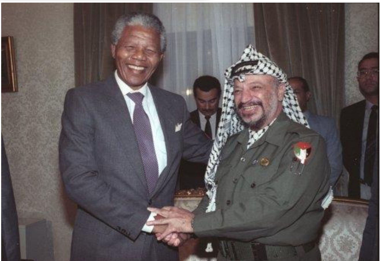
Embassy of Palestine in Hungary